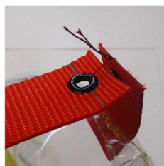
sealed with a double knot