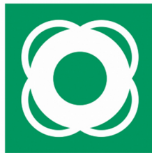
ISO sign for rescue equipment