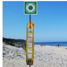
mounting option on a pole at the beach