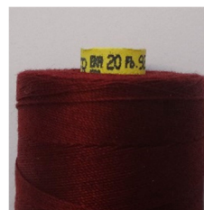
cotton thread thickness of 20